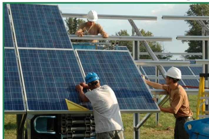
Solar panels being installed by a Vermont Company in Shelburne, Vermont

Vermonters have made clear which path they prefer. The only question remaining is if the next leader of our state will lead the state on that path.