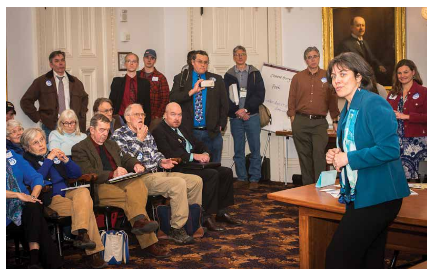
Speaker of the House Mitzi Johnson speaking in the State House on Clean Water Day.

Status: Enacted by Legislature, but VETOED by Gov. Scott; Senate vote 22-8.