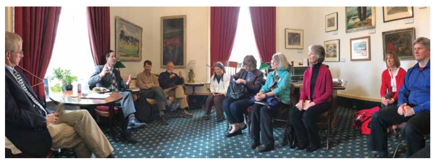
Middle right and bottom: Local energy leaders met with Lt. Governor David Zuckerman and House and Senate leaders, calling for bold action on climate change.